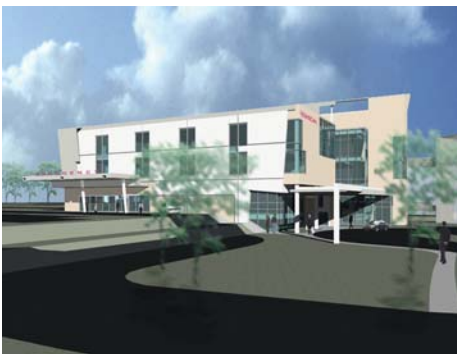
Rendering of Atlantic City Medical Center. Courtesy of Granary Associates.