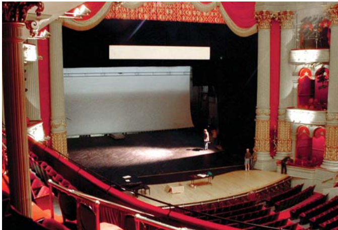
Interior shot of the historic Academy of Music

The Academy of Music has been featured, along with other award winning projects, in the October 2003 issue of Building, Design & Construction Magazine.