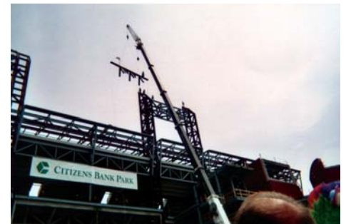
The ceremonial steel being raised to the highest light tower.

The 43,000-seat world-class Citizens Bank Park is opening April 2004. To view the progress of the ballpark, go to www.phillies.com and click on the Web Cam.