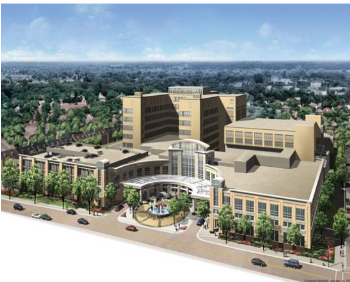
Rendering of Lancaster General Hospital. Courtesy of IKM Incorporated.

One of the biggest challenges the workers face is constructing the addition over top of the existing Lime Street Building. Workers take extreme caution in constructing this five floor addition since it is located directly above the hospital's