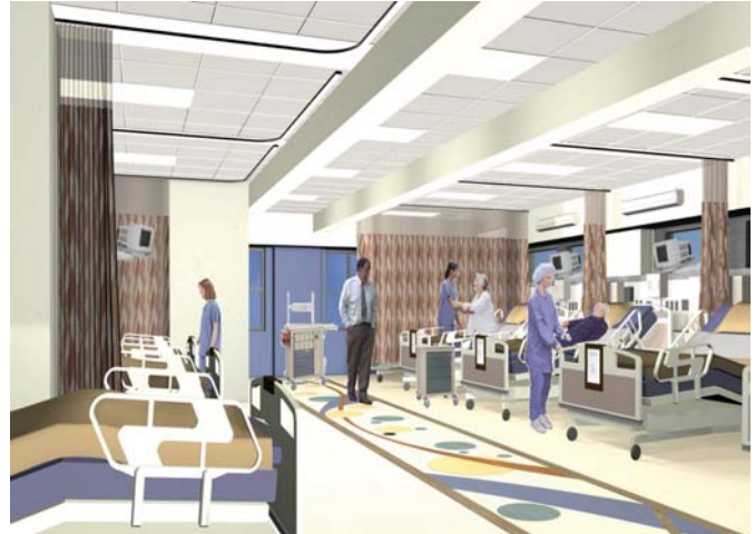
Rendering of the interior of the Orthopedic Center and first floor layout plan.

When all of the challenges are met and the expansion project is complete in December 2004, Lancaster General Hospital will have the ability to treat more patients than ever before. Inpatient bed capacity at the Duke Street Hospital will increase from 446 to 498 beds. The number of operating rooms at LGH will increase from 25 to 32. The Post-Anesthesia Care Unit will expand from 29 to 39 beds. Beds in the hospital's Day Surgery unit will increase from 20 to 36.