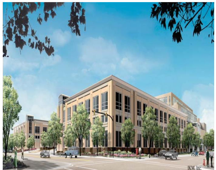
Rendering of LGH Orthopedic Center.