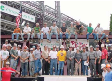
Workers posing with the signed ceremonial steel beam.

The ceremonial beam is set into place at the ballpark