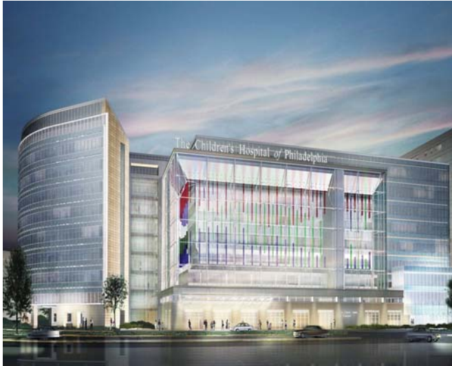
Rendering of the Children's Hospital of Philadelphia