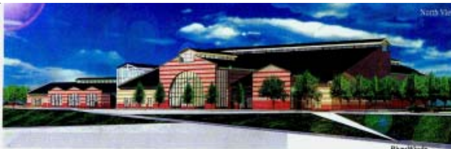
The RiverWinds facility has fitness options for the entire family.