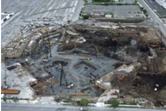
Much progress has been made on the new Phillies ballpark since demolition began in December.

ties that once ran under the current construction site were relocated.