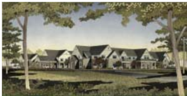
The Galloway Township facility offers short and long term care.

While there is only space for 35 people in the assisted living areas, there will be room for 151 long-term care patients. Their facilities are equipped with in-room nurse call systems and complete security in order to provide top-notch, quality care.